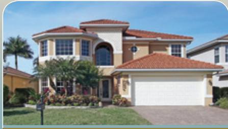
ENTERTAINER'S DREAM HOME!

Reserve At Estero $459,000 4BR, 3.5BA, 2C garage home. Tile & hardwood flooring, heated pool, lake view, outdoor kitchen with built-in BBQ.