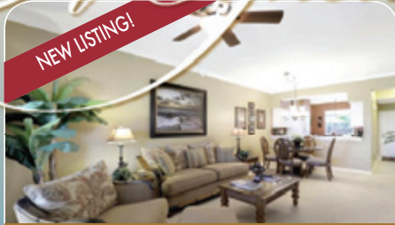
BEAUTIFULLY APPOINTED INTERIOR!

Huntington Lakes $274,900 2BR, 2BA plus den, 2C garage condo. All new S.S. appliances, eat-in kitchen, huge master suite, air-conditioned lanai & more.